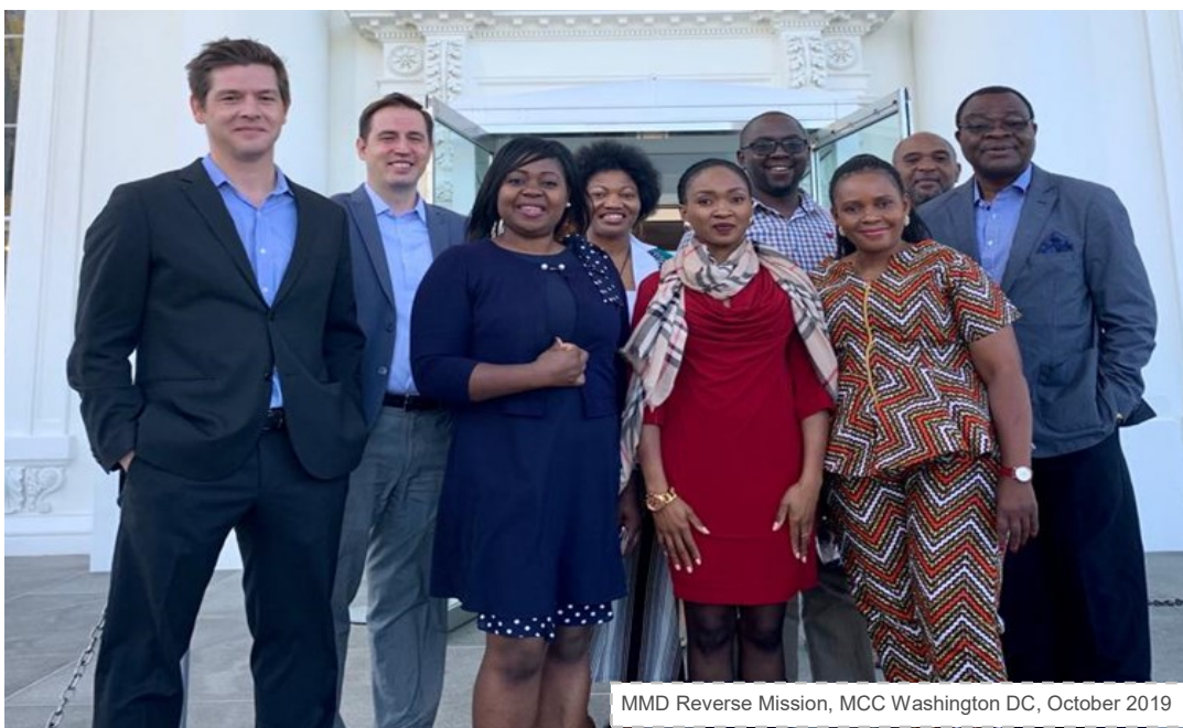
MMD Reverse Mission, MCC Washington DC, October 2019