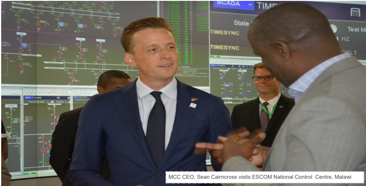
MCC CEO, Sean Cairncross visits ESCOM National Control Centre, Malawi